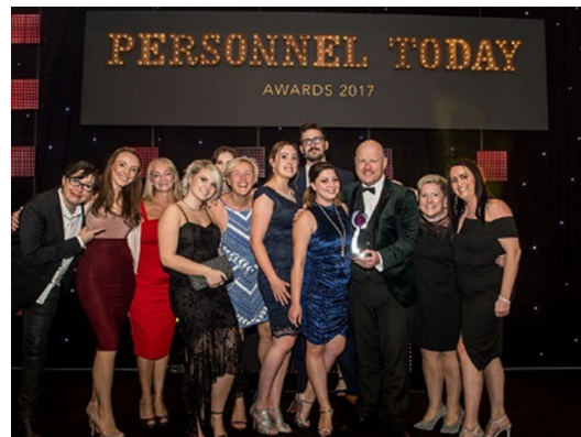
Personnel Today Best HR Supplier Partnership