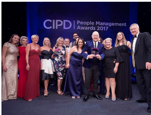
CIPD Best HR/L&D Supplier

MTD are a multi-award winning training partner that include CIPD and Personnel Today Awards.